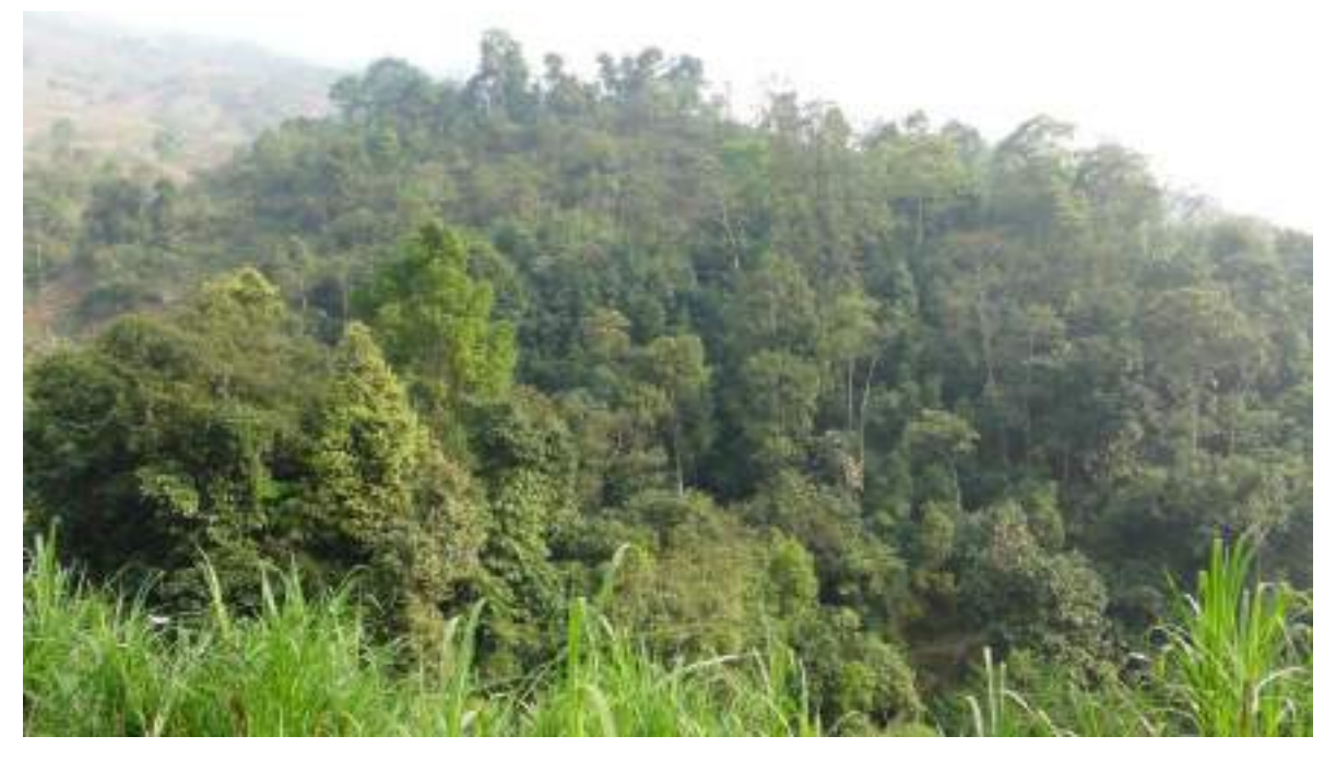
Community forest in Tui Man village, taken in March 2015