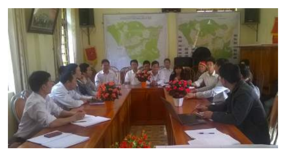
Discussion at the Phin Ngan communal office, March 2015