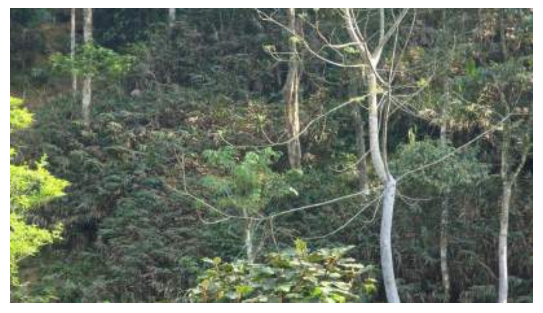
Sa nhân ( Amomum villosum var. xanthioides (Wall.) Hu & Chen) was integrated under the forest canopy, and becomes one of the income sources in Phin Ngan commune.

By the end of 2014 (after SPERI's support for community land for the four villages of Sai Duan, Sung Bang, Sung Hoang and Van Ho) there are four 4 main forestland users in the commune: (i) the Bat Xat district Management Board for Protected forests who manage 1,842ha (or 51.46%); (ii) households: 104ha (2.9%); (iii) village communities: 213 ha (5.95%); and (iv) communal People's Committee manage 1,420.4ha (or 39.68%). The communal authority is managing a large percentage of land in an uncertain manner because there is no land right certificate granted yet. Meanwhile, local people face shortage of land, especially forestland for their integrated crops and collection of vegetables and herbs. On the other hand, without confirmation of community forestland right, it is difficult for local people to practice and promote their traiditional belief and customs relating to worshipping in sacred forests and protection of forest.