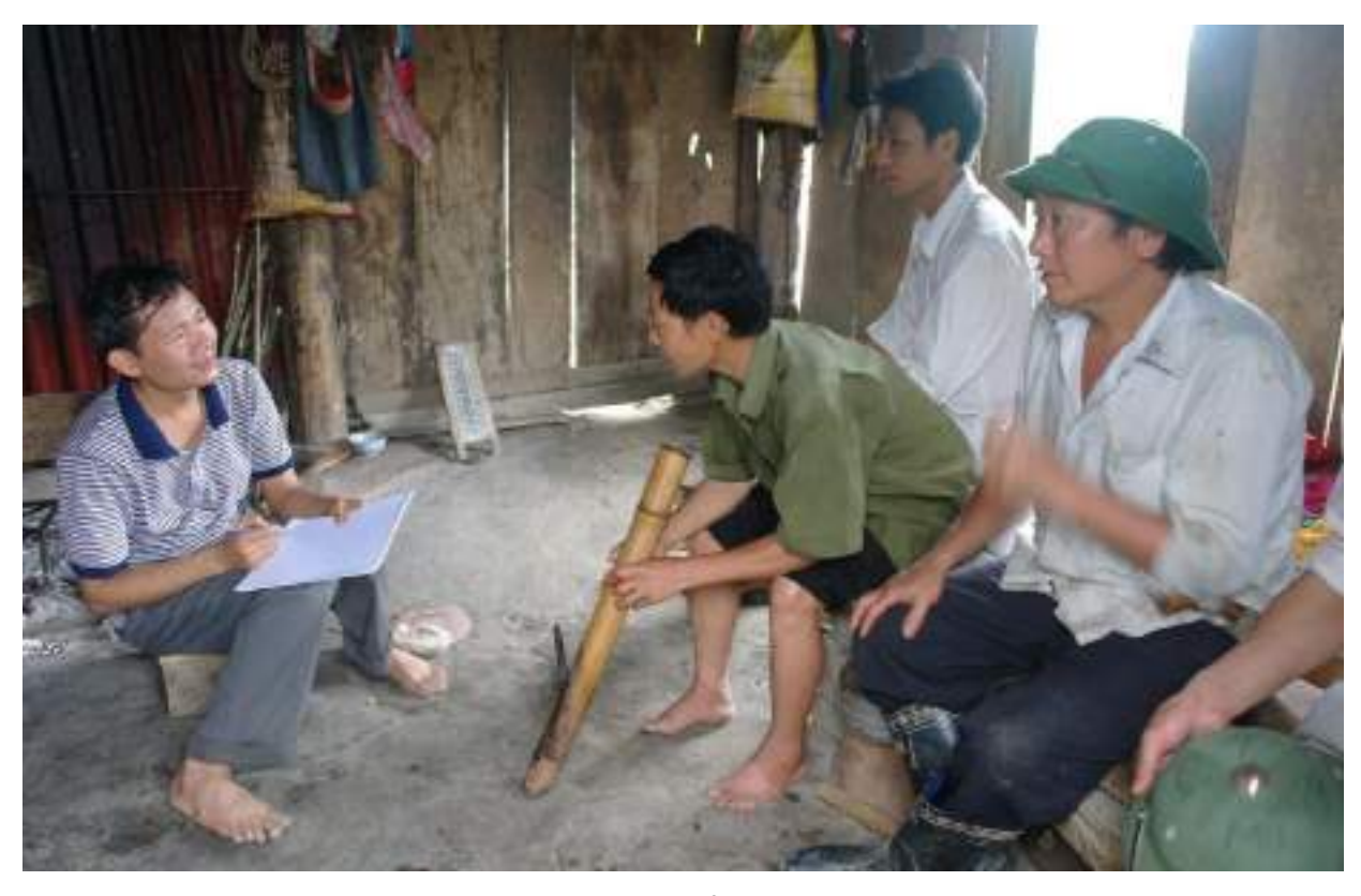
Study customary regulations on community forestland management, 6 June 2015