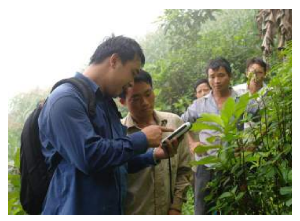
Practical training on using GPS for villagers, 6 June 2015