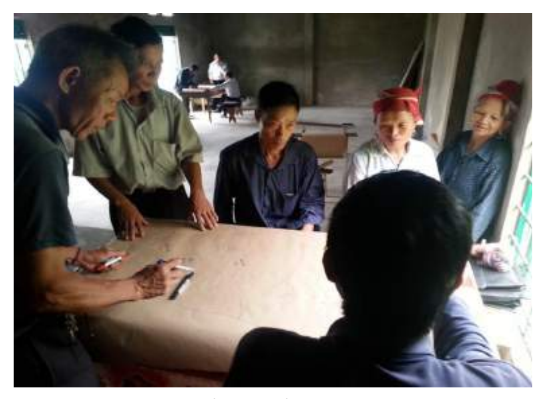
Drawing map of community forestland, 12 May 2015