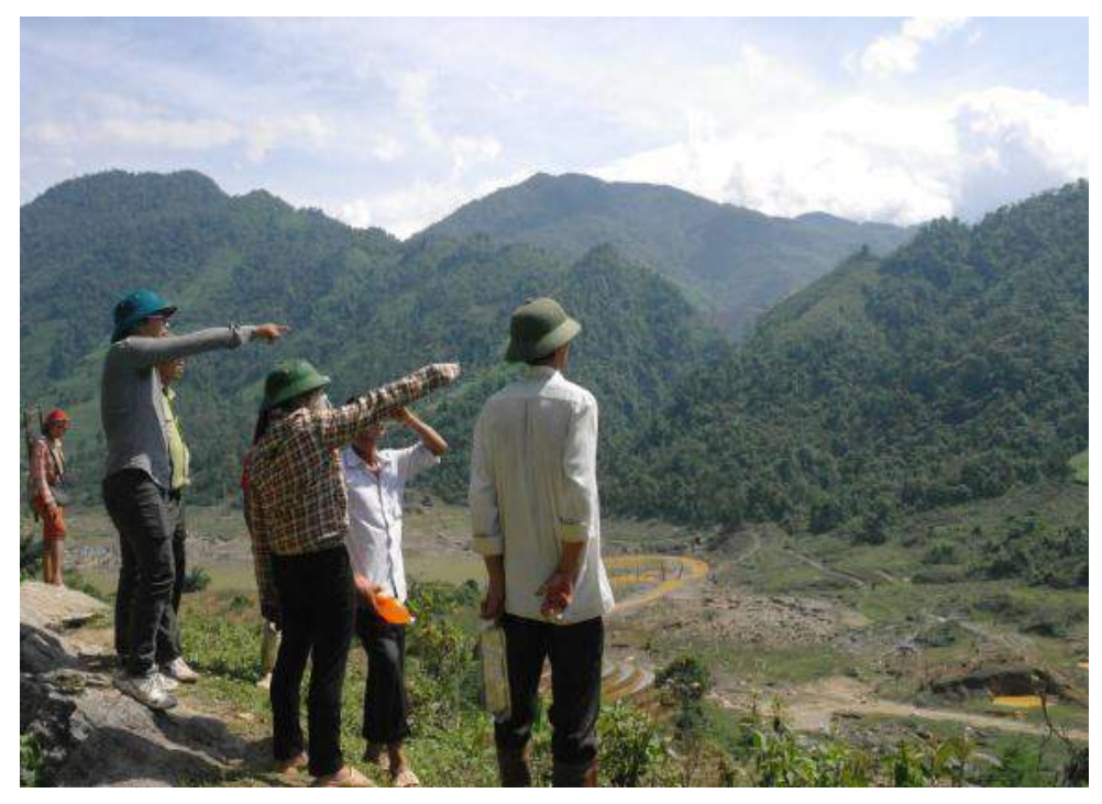
Villagers and technical taskforce joined field survey, 8 June 2015