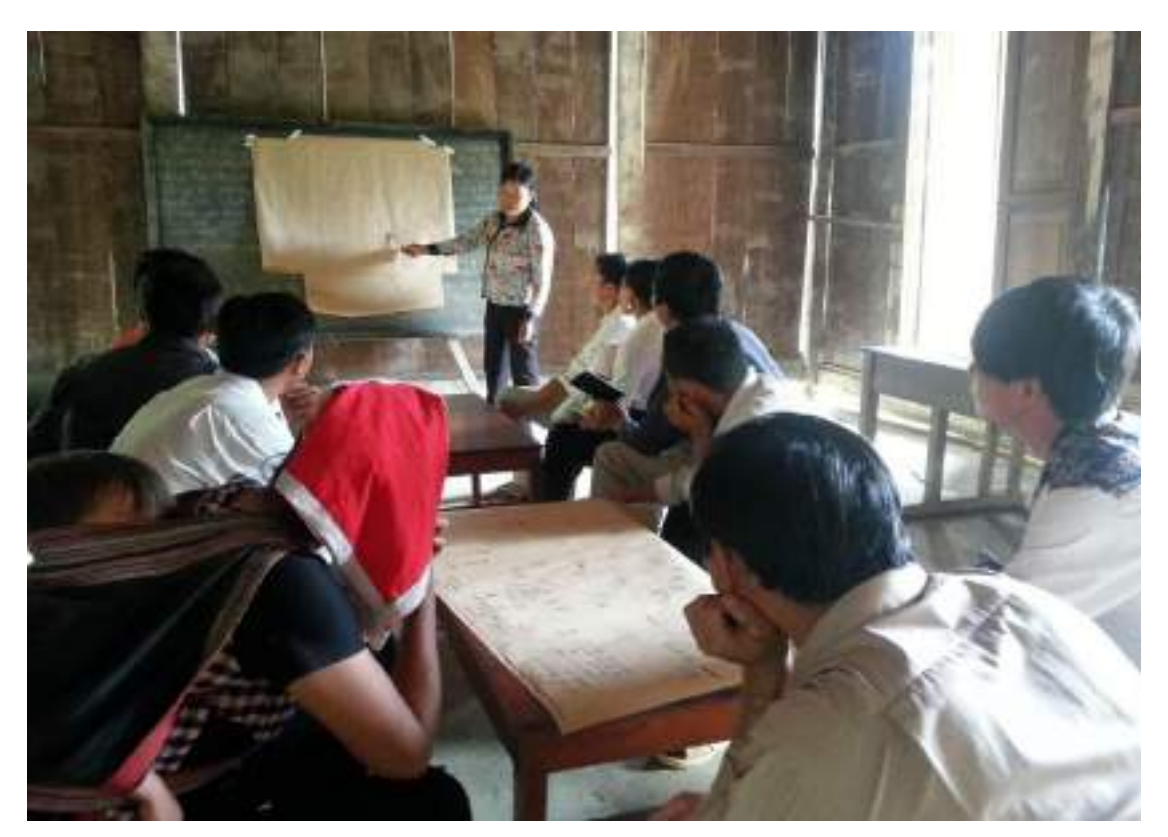
Villager present community forestland plots on their drawn map, 11 May2015